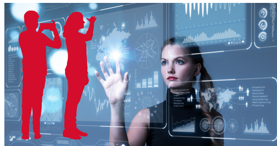
2. Personal digital assist guides course choices based on profile, interest and career direction. Organizes calendars, schedules, deadlines/ meetings, housing, finances, reminders, location, collaboration and social activities and checks on well being.