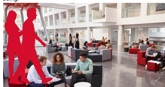
4. Community, industry and global initiatives fostered by collaborative environments that entice domestic and international partnerships.