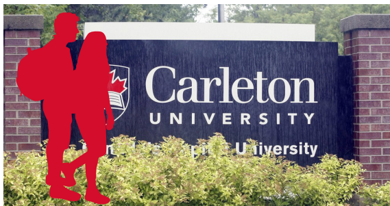
1. Student, Industry Representative or Staff/Faculty members enters Carleton University in 2030. The participate is excited, and nervous, but is ready to embark on this new adventure.