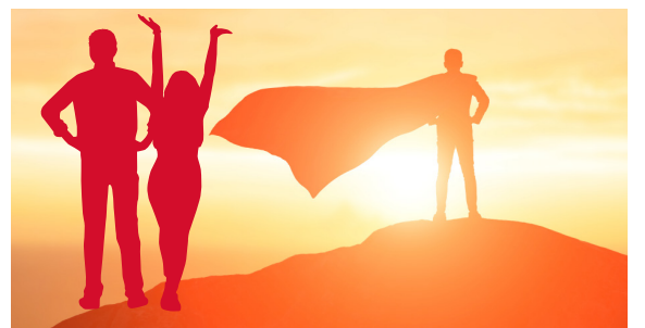
6. Members feel accomplished and empowered by newfound knowledge and transcendence, which was brought to him by Carleton University.

Carleton University provides the means for personalized program curriculum, customizable spaces, transcending experiences, and connections.